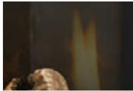
Black illusion glass