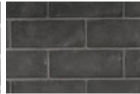
Westminster grey standard