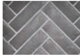
Westminster grey herringbone