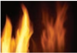
MIRRO-FLAME porcelain reflective radiant panels